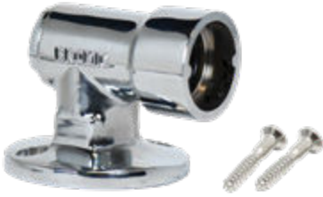
Part No. 1510151