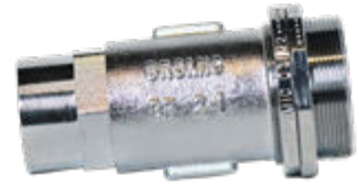
Part No. 1510165