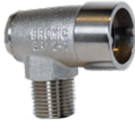
Part No. 1510158