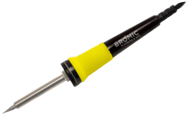
PART No. 1811725 BROMIC 25W ELECTRICAL SOLDERING IRON